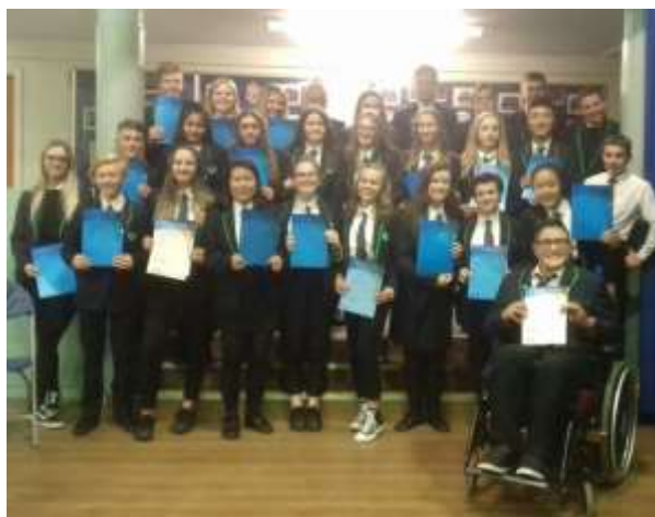
5 - Our last celebration was in 2019 before the pandemic.

Any Lenzie Academy pupil who has gained any Wider Achievement Award will be invited together with family/carers to have their award formally presented. All pupils with an award will be contacted soon to see if they wish to attend and how many supporters they would like to bring. The celebration will be hosted by the pupils and refreshments will be provided by the Hospitality pupils. We are looking forward to seeing many of you there.