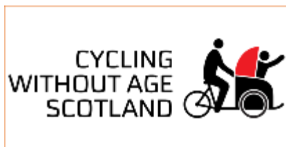
Cycling Without Age