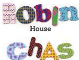
Children's hospices across Scotland