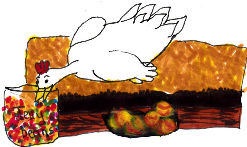
How easter eggs are really made