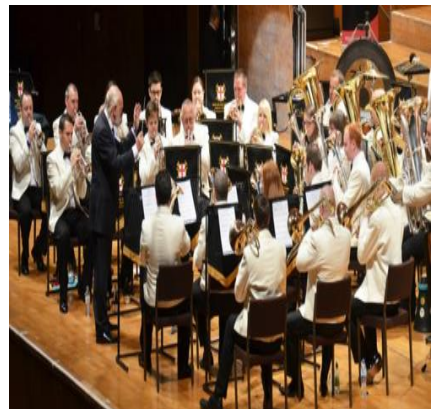
BRASS AND PERCUSSION