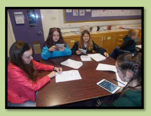
Researching famous people who have 'bounced back' in Social Subjects.