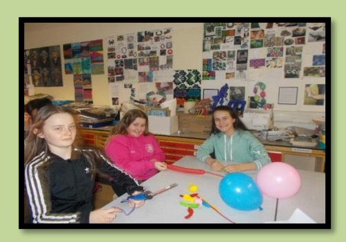
Making balloon sculptures in Art.