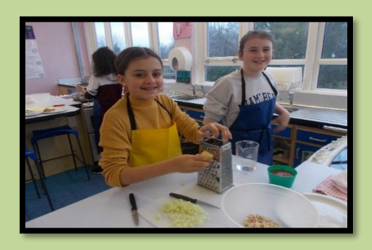
Making pasta in HFT.